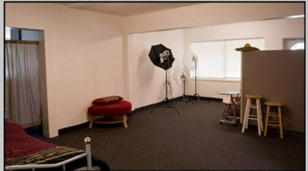
Main Shooting Area